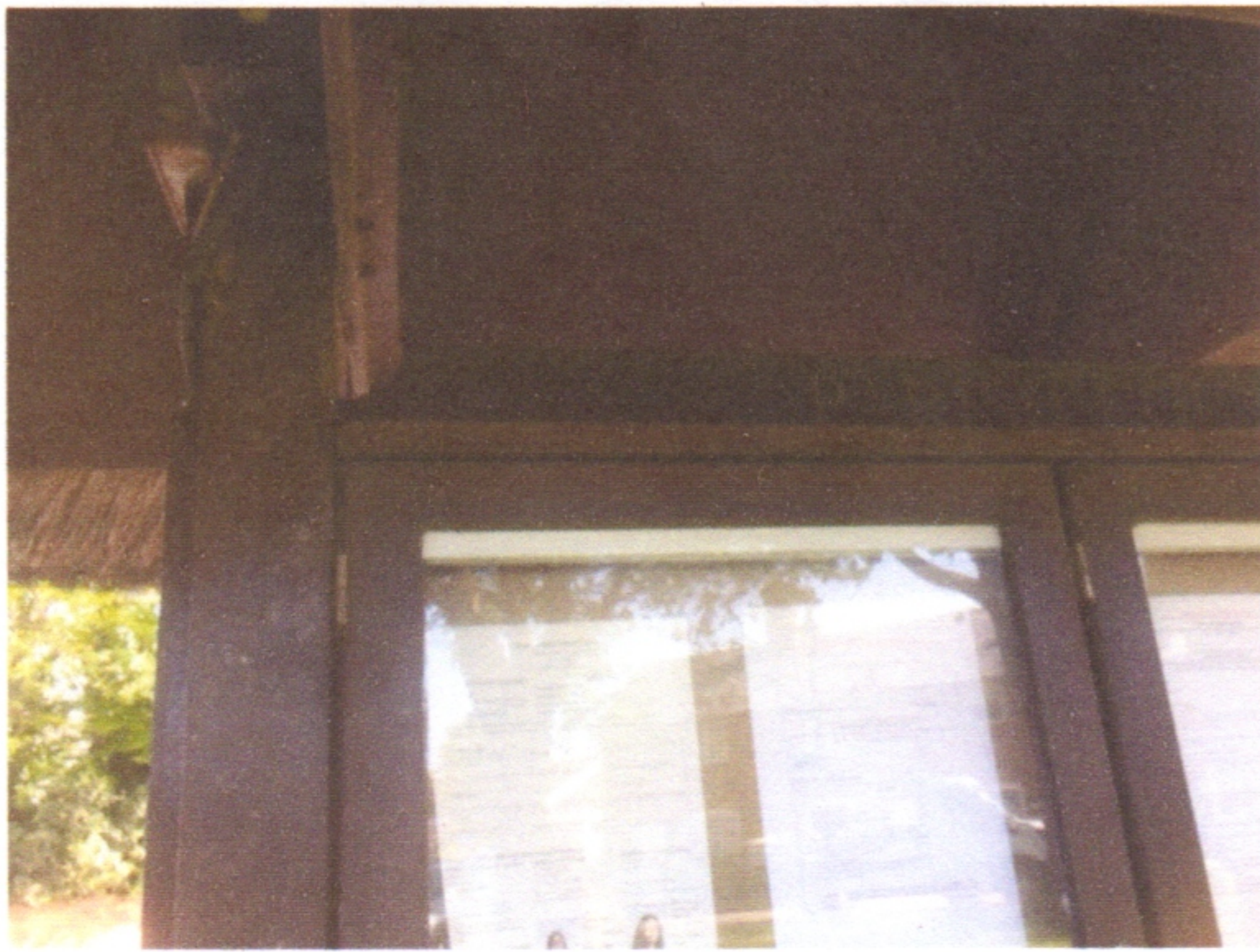
Notice Board After Cleaning

You are turning Dunchurch into the well cared for place the community want to see.